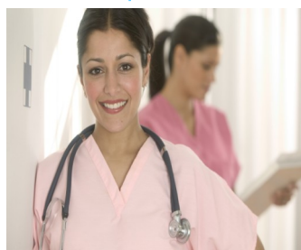
Specialist Addiction Nurses supporting recovery 24 hours a day every day

We have a number of different detox programmes on offer at Pierpoint. It’s not ‘one size fits all’. Everyone is different and has different levels of withdrawal, so with this in mind, apart from the main medications we use to detox you with, we also give you medications based on your ‘symptoms’.